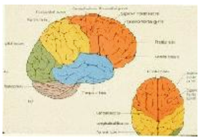
Lobes of the brain