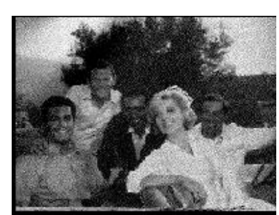
The original cast; click to hear the theme (395k .au file)

Physically, there are many things that could happen to your brain that would not allow it to process memory. Lesions on the temporal lobe would affect both encoding and storage. As well, each individual memory is broken up into sections and distributed all over your cortex. Something called the hippocampus creates a "map" which allows all the necessary bits and pieces to be retrieved and reassembled. Any damage to the