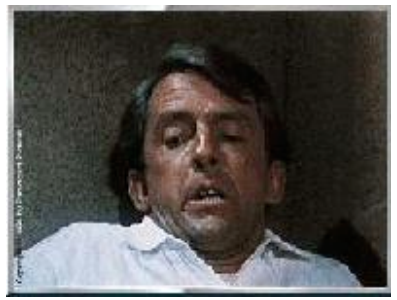
Rogosh (played by Fritz Weaver) reacts to the news he's forgotten the last three years;

In almost all cases, most memories, except for the accident itself (due to an encoding deficit that occurrs during the moment of trauma), are normally recovered. Those that don't, due to permanent brain damage, are called "islands of amnesia."